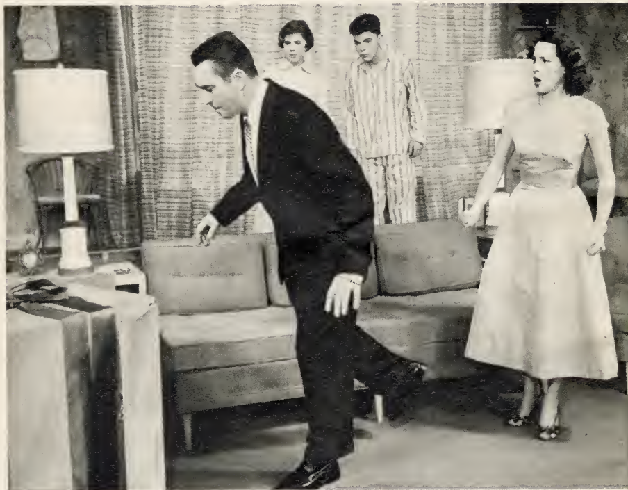
Macdonald Carey displays anti-TV footwork as Kitty Carlisle and stage children stare.

Several weeks ago, TV Guide described Hollywood's nonstop needling of television. But ribbing TV is no movie monopoly. Insults and indignities—not to mention flying footwear—have been aimed at television by the Broadway stage. Since TV has endowed the theater with plays, playwrights and players, this is grievous gratitude indeed.